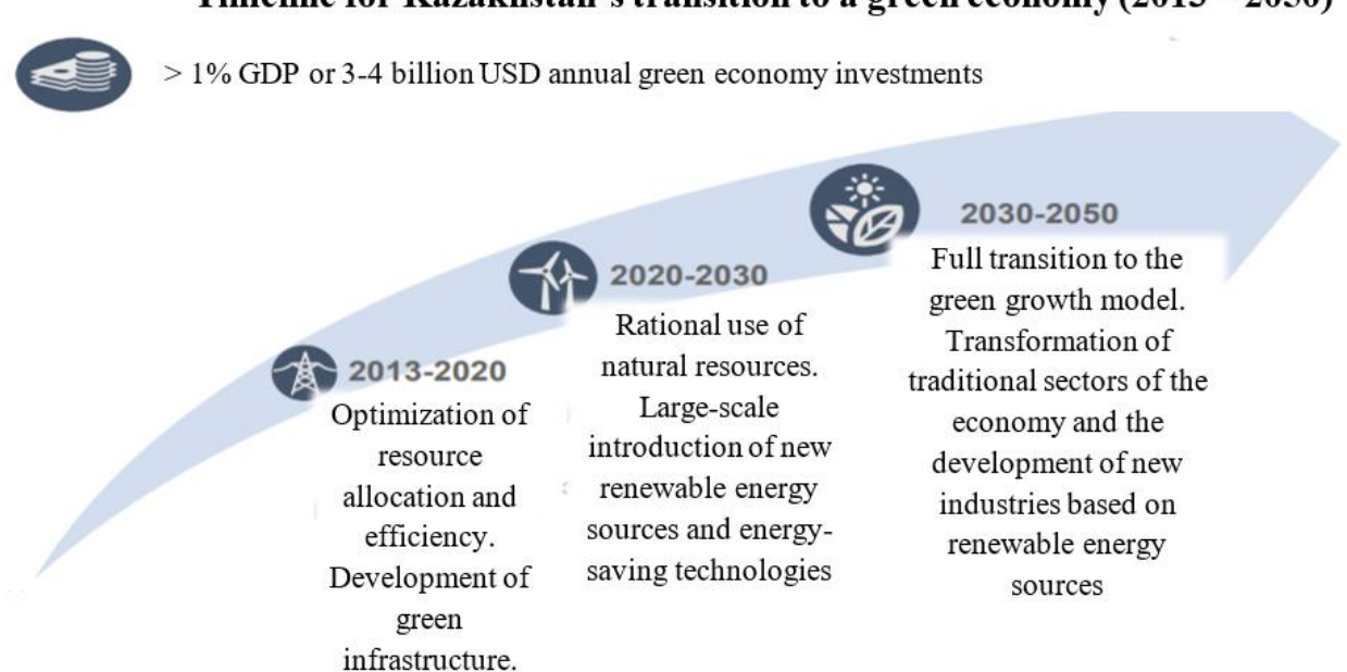
Timeline for Kazakhstan's transition to a green economy (2013 – 2050)

Figure 1 – Timeline for Kazakhstan's transition to a green economy (2013-2050)